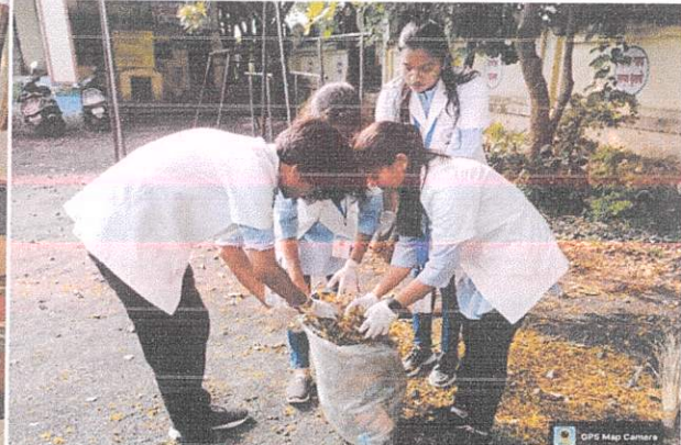
Wela harichandra, Maharashtra, India Vela Hari Gaon, 332V+268, Wela harichandra, Maharashtra 441108, India Lat 21.050015° Long 79.092815° 01/09/22 03:51 PM