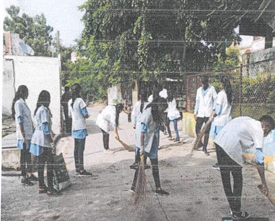
Wela harichandra, Maharashtra, India 23XV+C6W, Wela harichandra, Maharashtra 441108, India Lat 21.048995° Long 79.092681° 01/09/22 03:36 PM