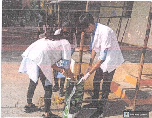
Wela harichandra, Maharashtra, India Vela Hari Gaon, 332V+268, Wela harichandra, Maharashtra 441108, India Lat 21.049756° Long 79.093049° 01/09/22 03:27 PM